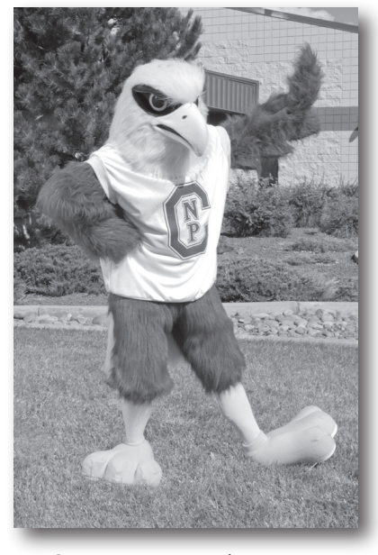
NPC Mascot Ernie Eagle

Ernie Eagle represents the college at community and college events and on social media websites. Be sure to join over 1,500 of Ernie's friends on Facebook. Ellie Eaglet is the spokeseagle for the Kids College program.