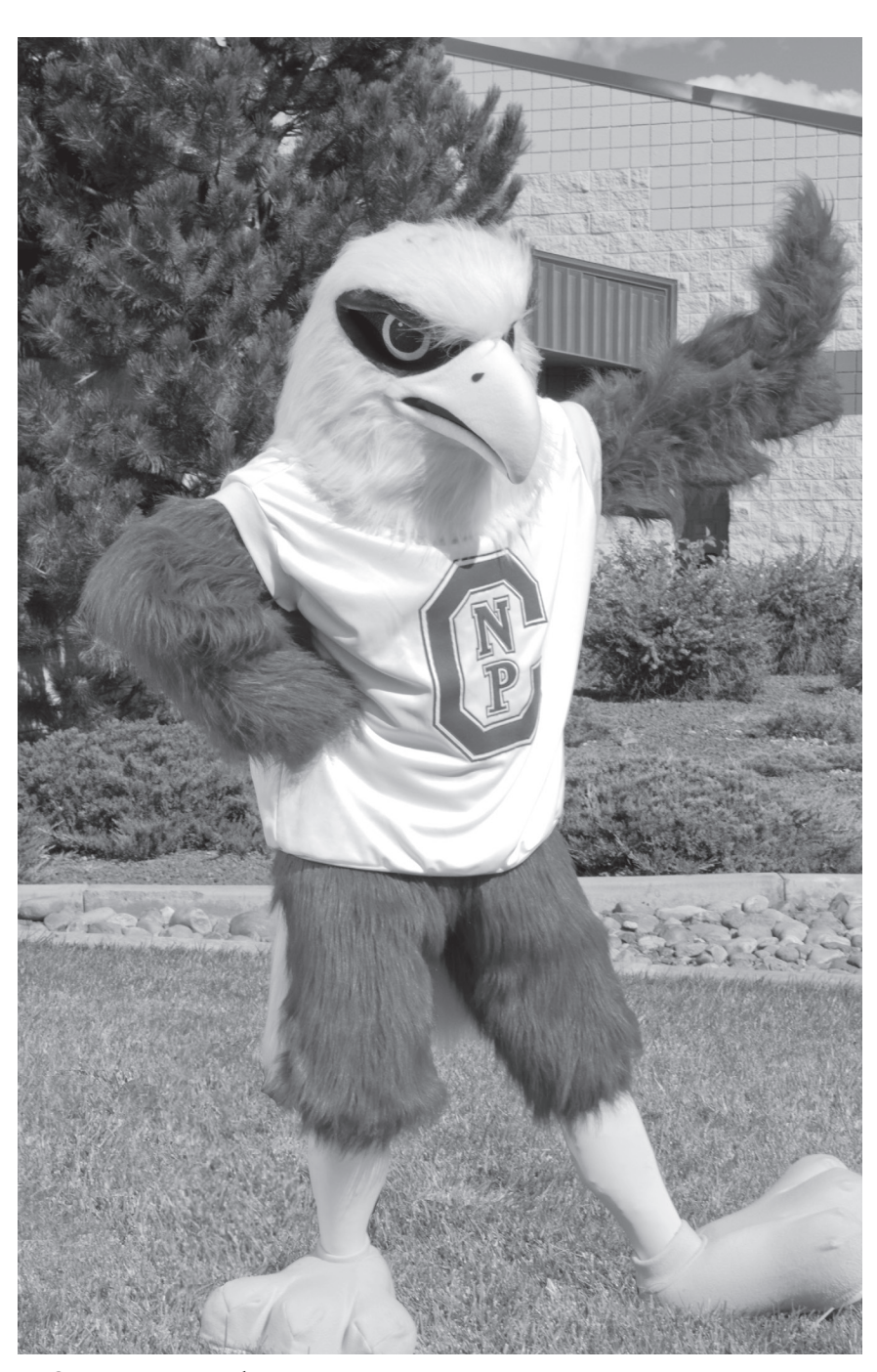
NPC Mascot Ernie Eagle