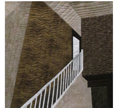
Locally Grown 2017 Cathy Clark: The Light at the Top of the Stairs

Closing Reception and Awards Ceremony: Friday November 30 6 - 8 PM