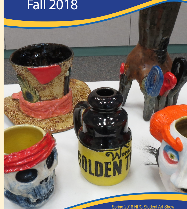
Spring 2018 NPC Student Art Show artwork by Tia Clark, First Place in 3D Art