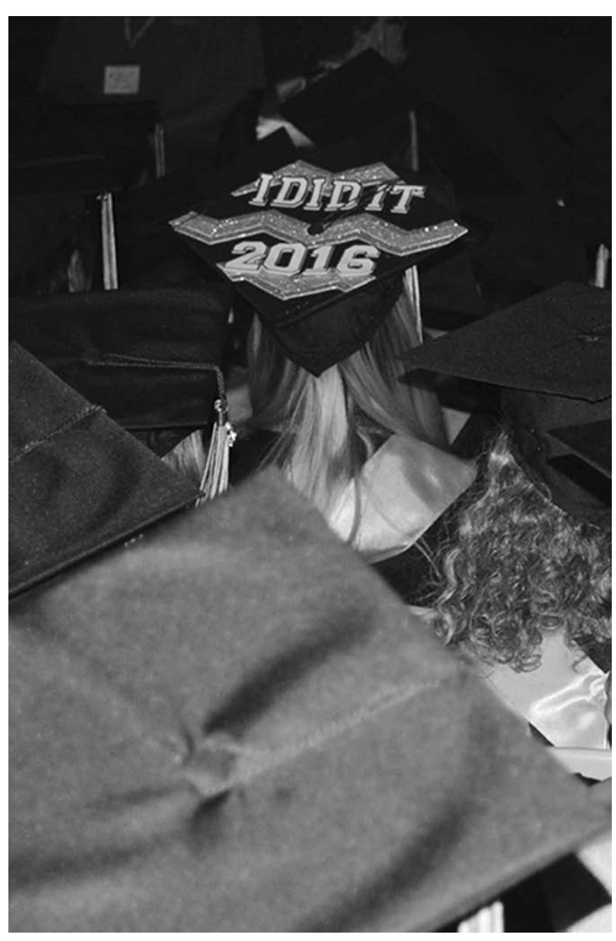
A mortarboard message sums up the success of this NPC student.