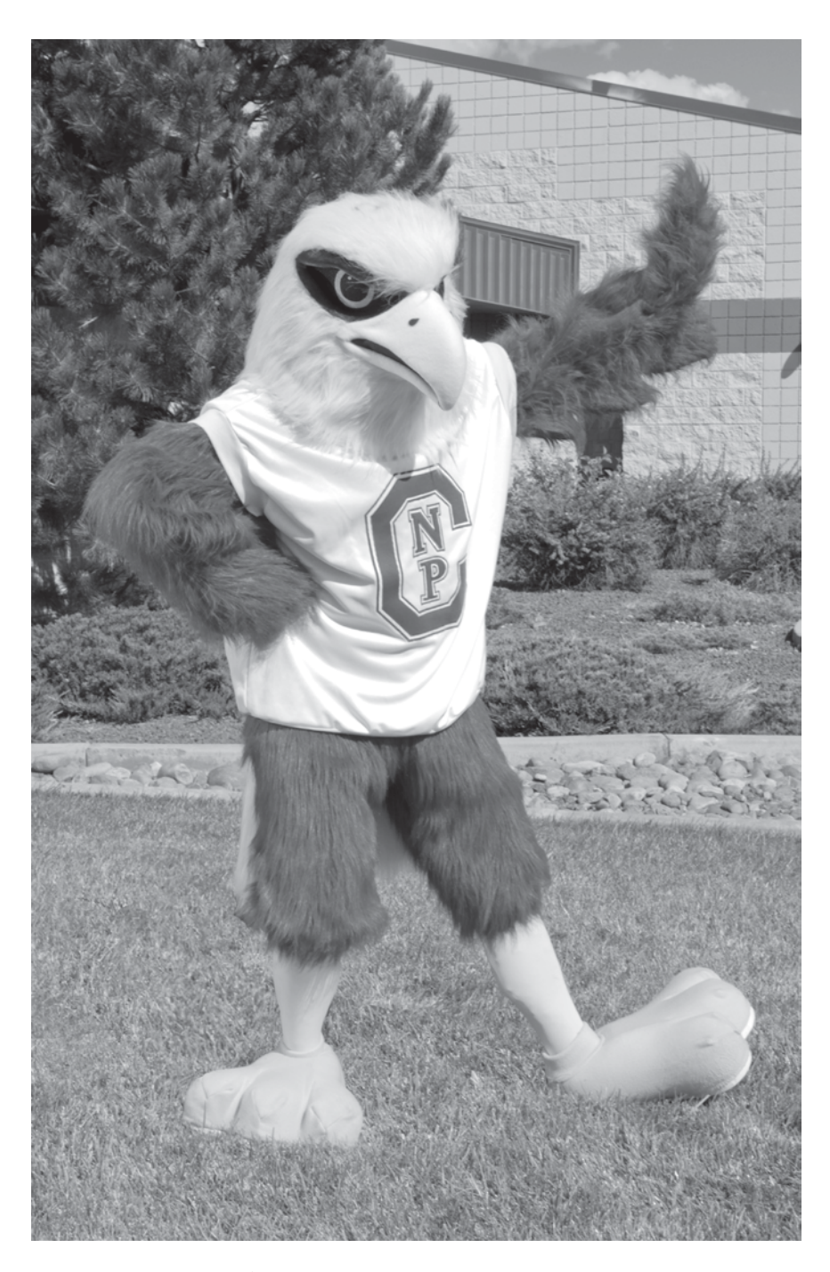
NPC Mascot Ernie Eagle