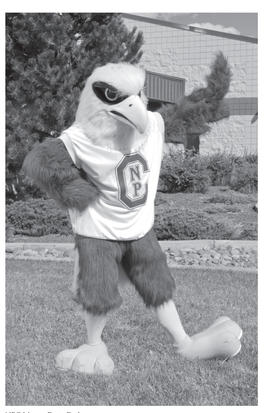
NPC Mascot Ernie Eagle